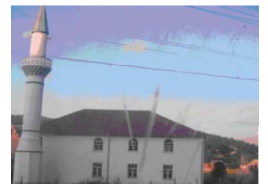
Islam Mosque in Ukraine

Then we were told that a window of perhaps 10 more years was estimated that the Gospel of Jesus Christ could be freely preached... after that, the Muslims would probably have a great deal of control. So you can see the great need of diligently continuing the work that the Lord has called us to do.