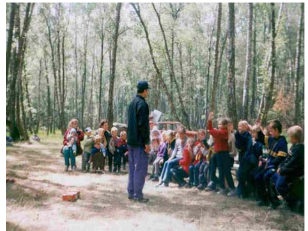
Summer Camp 2004 in Chernigiv Oblast