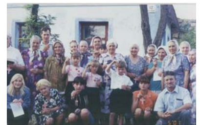
A rural church in Ukraine with Pearl's crosses