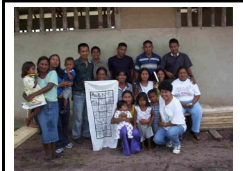
This scarf tells the Bible Story from creation to Christ's ascension through a series of 21 pictures. Telling the Good News through "Chronological Bible Storying" is the greatest change in missionary strategy in recent history and we are excited to be part of it!