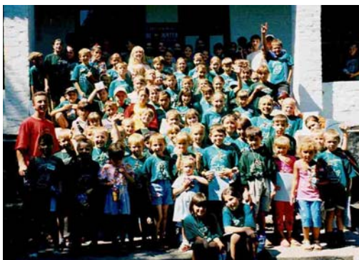
Smiling faces from one summer day camp.

next year! I think many children will invite Jesus into their hearts."